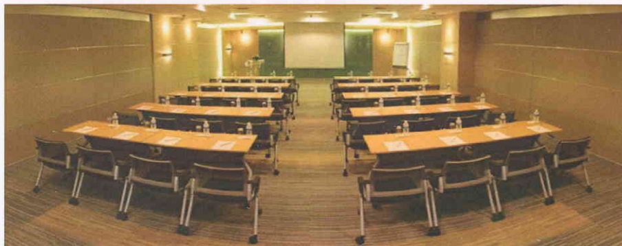
Meeting Room Facility