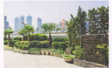
Green Open Space