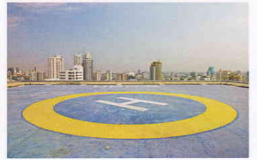
Helipad with FAA Standard